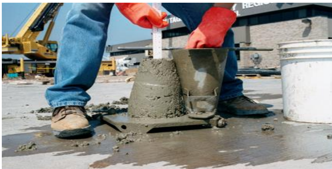
Figure2. Responses to "Concrete Workability Measurements: The Slump Test